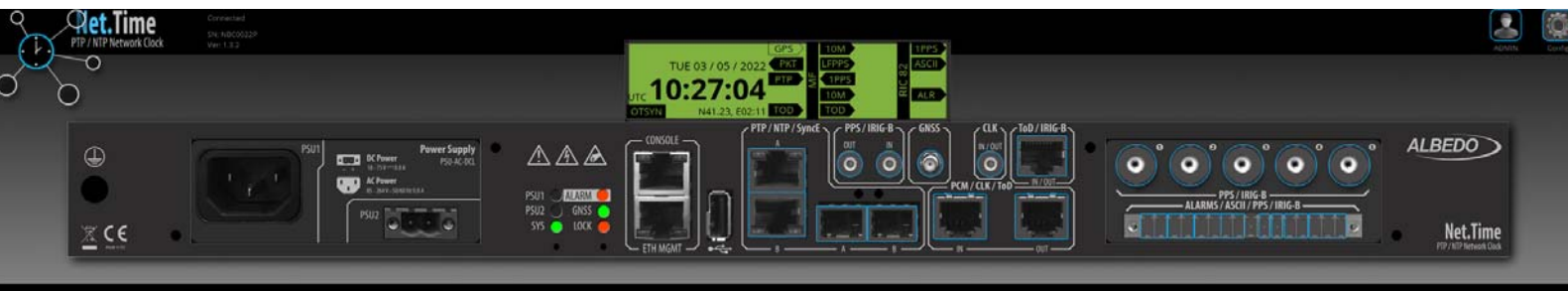
Fig3. Graphical User Interface based on a web server.