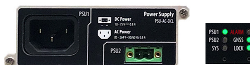
Figure 2. Power Supply and LEDs