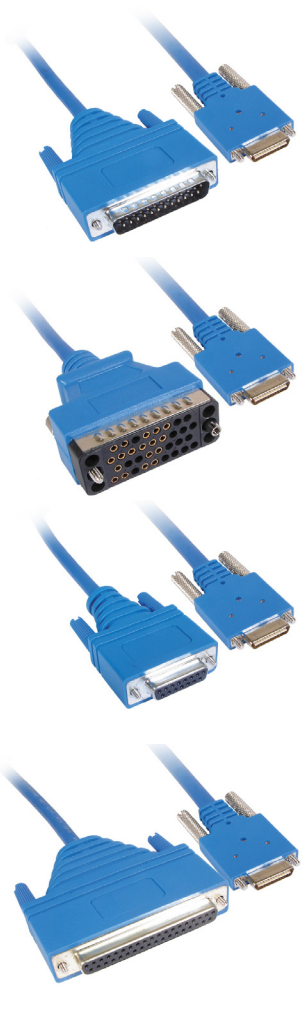
Smart Cisco Data Cables